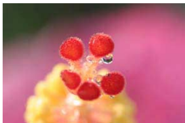
Exposure: F/5.6 Auto +0.6EV ISO100 WB: 5500K (Taken by a digital camera; APS-C size.) Macro Magnification Ratio: 1:1 (life-size)

Caution : Please read the instruction manual carefully before using the lens.